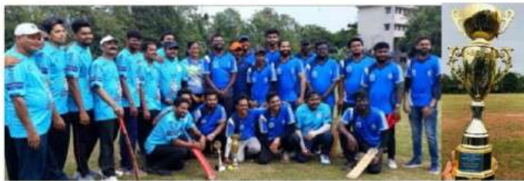
The cricket team of Srinivas University Mukka Campus have won the trophy and Srinivas University City Campus – Pandeshwar were the Runners Up.