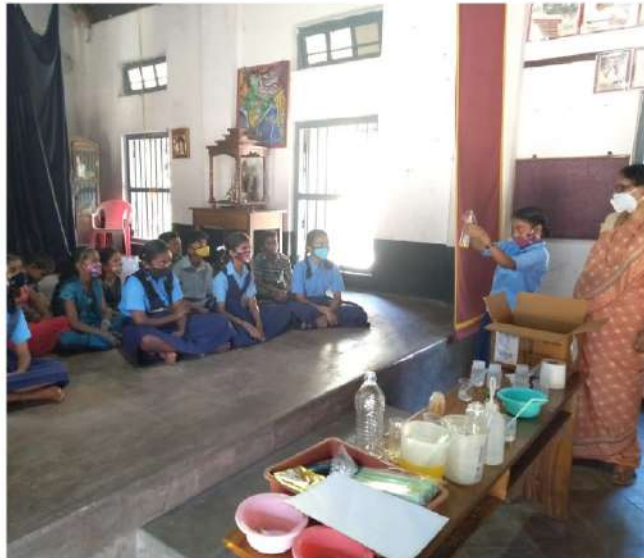
Student Performing the Curiosity Experiments on Acids and Bases on 11th December, 2021 @D.K.Z.P.H.P. School, Sasihithlu

Pandeshwar : Srinivas University under its Unnat Bharat Abhiyan Forum in collaboration with Sponsored NGO 'Srinivas Institute of Rural Reconstruction Agency' (SIRRA) and Dakshina Kannada Zilla Panchayat Higher Primary School, Sasihithlu has organized "Science Sensitization Programme- Curiosity Experiments: 1. Acids and Bases" at Dakshina Kannada Zilla Panchayat Higher Primary School, Sasihithlu, Mangalore on 11th December, 2021. This Govt. Higher Primary School is adopted by the University under the Government School Adoption Programme of Government of Karnataka.